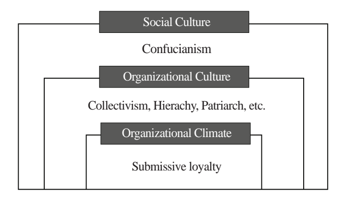
Figure 1. Conceptual Background of Submissive Loyalty

The organizational culture of the country has long adhered to the collectivism and hierarchy rooted in Confucianism (Oh, Min, Kim, et al., 2017). According to the Hofstede Center (https://geert-hofstede.com/), Korea scores above the median for the cultural dimensions of collectivism (versus individualism) and acceptance of unequal power distribution. Notably, Korea earned 18 out of 100 points for individualism (86th among the 102 countries surveyed). The prevalence of Confucian values (patriarchy, collectivism, hierarchy, and privilege for men, superiors, and seniors) has created a unique Korean organizational workplace culture. This culture generates an organizational climate grounded in "employees' shared perceptions of organizational events, practices, and procedures" (Patterson, West, Shackleton, et al., 2005, p. 380). We term this unique Korean corporate climate "submissive loyalty." Figure 1 illustrates the conceptual background of submissive loyalty—social culture, organizational culture, and corporate climate.