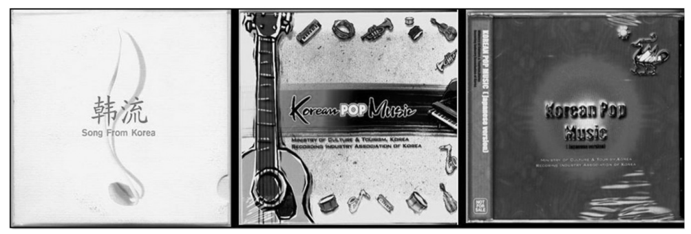
Figure 4. First K-Pop Promotional CDs Manufactured by the Korean Government

The Ministry of Culture took other measures to support the introduction of Korean pop music to various Asian countries (Ministry of Culture and Tourism, 2001, p. 400). For example, the ministry sponsored a music program titled Seoul Vibration on Channel 5, which is a part of Star TV that is widely broadcast across Asia. It also sponsored another music program called Listening to Korea , which was jointly produced by Woojeon Soft of Korea and CNR of China. That program was aired on Saturdays and